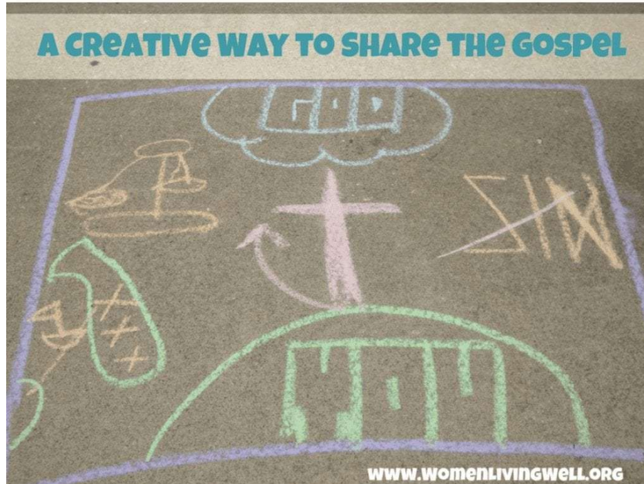
Chalk Gospel by