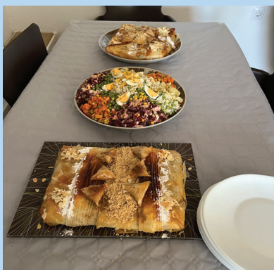
Lunch with the Moroccan family