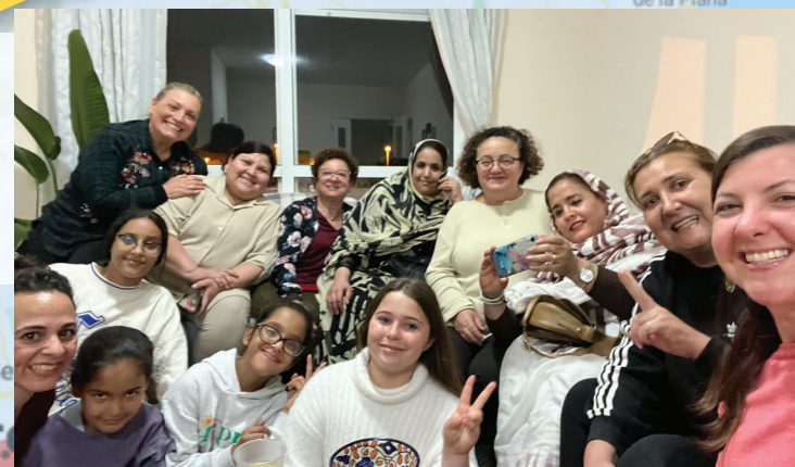
Ladies event in my apartment

ship, I look forward to asking her more about this and pray that we could read the Bible together. Everyone who attended said they LOVED the time together and that we definitely need to do it again! Praise the Lord!!