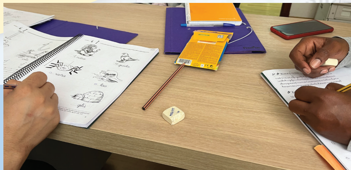
The ladies hard at work.

I had a moment on Thursday as I sat with this dear lady on my left and on my right was a refugee lady from Sudan where I thought, "What a gift it is to show the love of Jesus to these women. On the outside we look very different - they are wearing head scarves and I am not, we have different colored skin, we have had different life experiences, yet we are each dearly loved and valued by our Creator." Then the Sudanese woman's baby began to cry and I got to