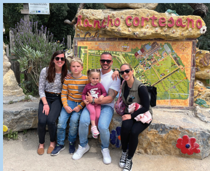
The birthday party, the petting zoo