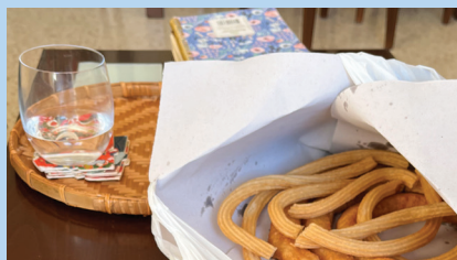
Me, introducing my friend to churros & chocolate!

The LORD has established his throne in the heavens, and his kingdom rules over all. Bless the LORD, O you his angels, you mighty ones who do his word, obeying the voice of his word! Bless the LORD, all his hosts, his ministers, who do his will! Bless the LORD, all his works, in all places of his dominion. Bless the LORD, O my soul!"