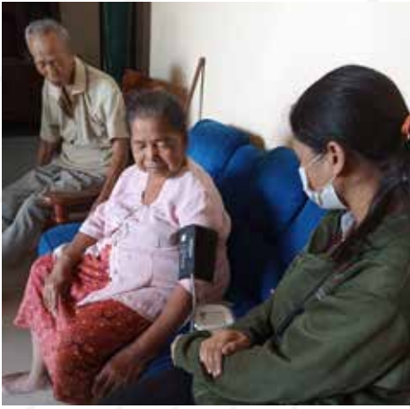
A nurse takes a woman's blood pressure.

1 ETERNAL PEACE CLINIC. Pray for the eternal Peace Clinic staff to be bold as they witness to patients. Pray they will be in God's Word daily and be able to give a defense gently and respectfully to anyone who asks for the reason of the hope they have in Christ (1 Peter 3:15).