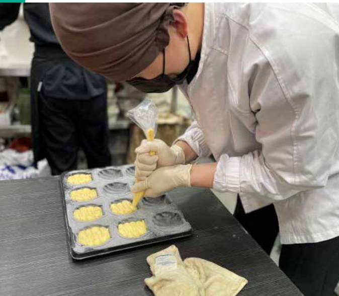
A refugee working at The Bakery.