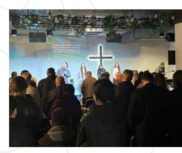
Ukrainian church.

31 EUROPE. Europe is the most lost continent on earth with 17,531 people dying daily without knowing Christ as their Savior. Pray for workers, their local partners, and believers to share the hope of Christ. Pray for more workers for this lost continent!