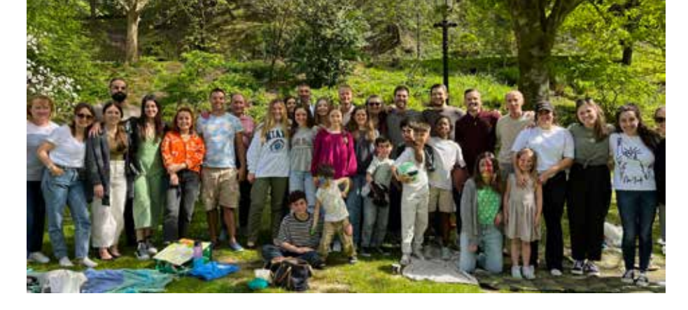
First IMB church plant among the Basque.