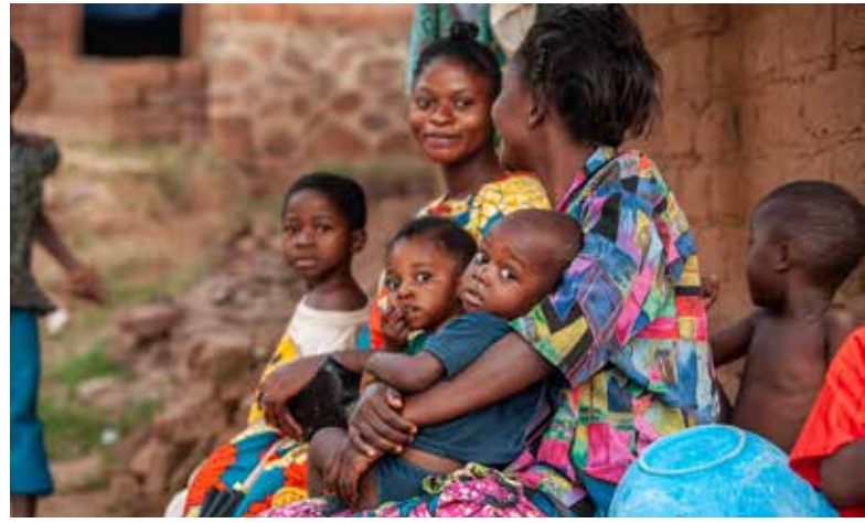
Families in the Democratic Republic of Congo (DRC) gather on their porch in the evening.