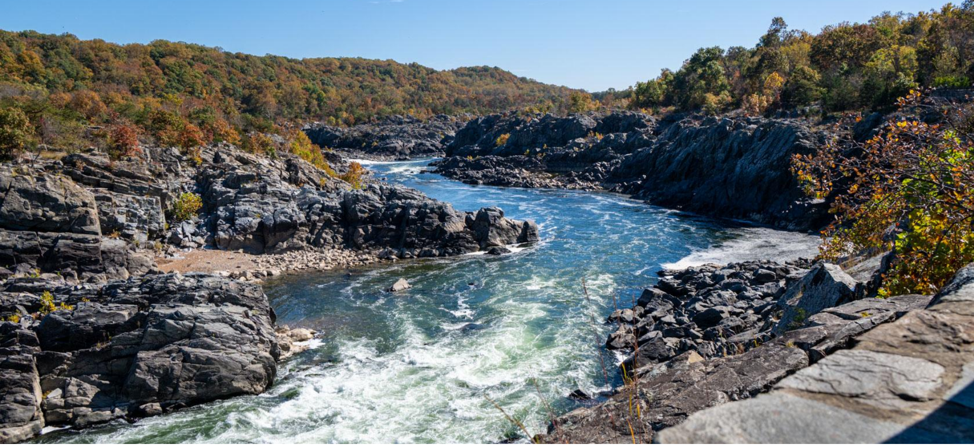
The downstream view