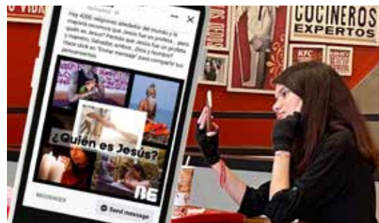
A young woman views an evangelistic social media ad.

In one city, a young woman suffering from depression saw a social media ad about the value of each person being created by God. She messaged the