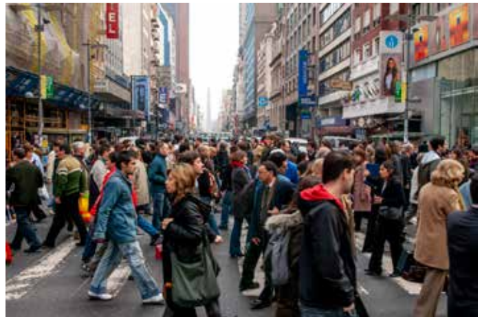
People crowd the streets of Buenos Aires, Argentina.

Sidewalks in global cities are busy as people rush by with eyes cast down, as if hoping to avoid eye contact. They hurry by, searching for something to give them hope. Your IMB missionaries go out into these busy sidewalks to meet people, build relationships, and share the gospel. It's a challenge for missionaries to gain access among the large populations living in high rise buildings and behind gated communities in the most crowded cities across Latin America. Most people in the Americas are highly relational, but it takes time to develop those relationships. An added difficulty is the sheer number of languages and dialects spoken in each of these cities, such as in Sao Paulo, Brazil, where thousands of Indigenous people have moved to the city from at least 38 tribes that speak different languages. While most people in Latin America have widely been assumed to hold a Catholic worldview, research among younger generations exposes that this worldview is shifting. This past summer, students from the U.S. joined missionaries in Mexico City and spoke with 100 people on the street. They found only one