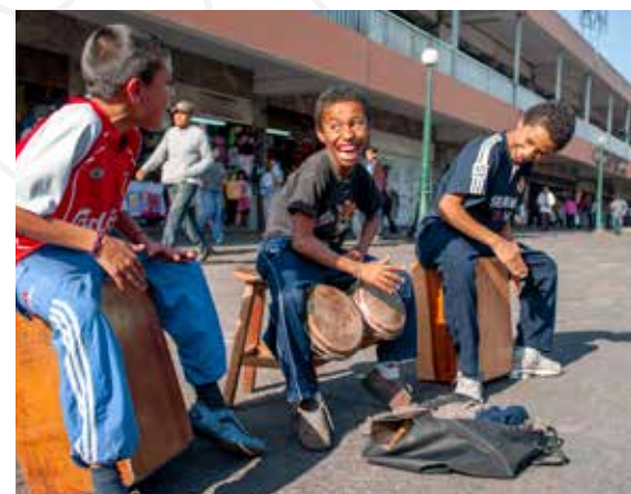
Children perform for money in one of market districts in Lima, Peru.

30 VOLUNTEERS. Please pray for U.S. volunteers that labor alongside IMB missionaries in Brazil, Costa Rica, and Panama to serve well while on the field and return home ready to share the gospel wherever they go. May many be called to full-time missions or ministry!